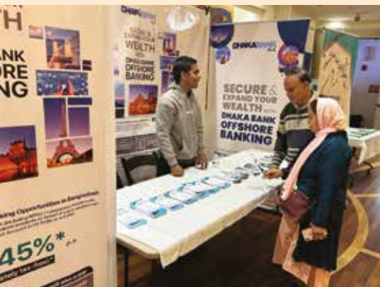
Dhaka Bank booth at Bangladesh Remittance Fair 2024